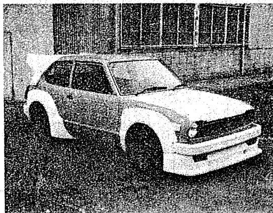
MUGEN CIVIC COMPLETE CAR